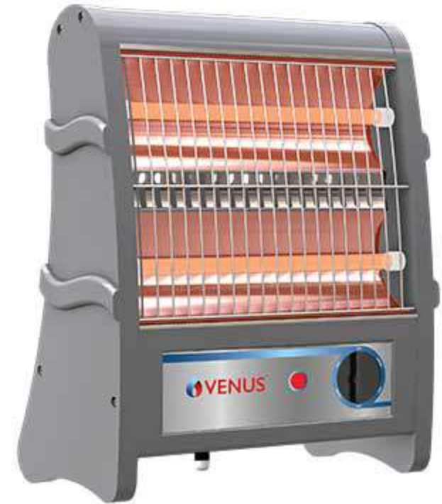
Model No: QH800